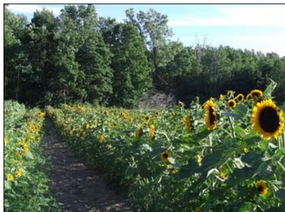
They also sell fresh cut flowers, like these sunflowers, throughout the summer.

Being a member of MIFMA allows us to network with other markets sellers from around the state. This gives us educational information on farming and selling techniques from other in the same kind of business.