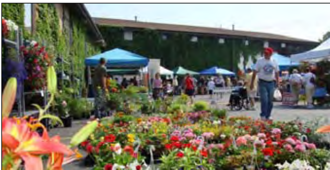
Frankenmuth Farmers Market, MIFMA member since April 2007

MIFMA was established in 2006 by Michigan Food and Farming Systems and key partners at Michigan State University. MIFMA is supported by a grant from Project for Public Spaces, Inc., with funding provided by the W.K. Kellogg Foundation.