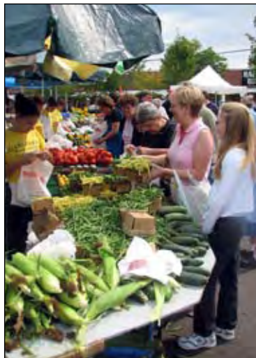
Farmington Farmers and Artisans Market, MIFMA member since July 2007

MIFMA received permission from member markets to use all photos. Copying of photos for other intentions is prohibited.