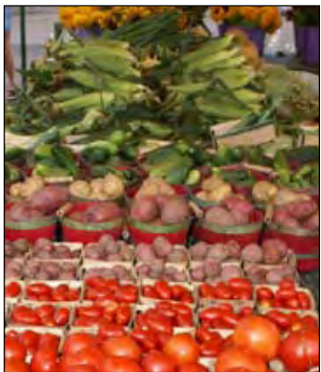
Northville Farmers' Market, MIFMA member since September 2007.

Farmers markets bring farmers and vendors together at a specific location on a regular schedule to sell their food and farm products to the public. These markets put a face on local food and connect consumers with the farmers who grow their food, offering access to fresh, local produce for everyone.