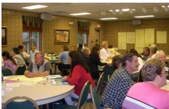
Farmers' market stakeholders discuss MIFMA's mission and vision.

Since the visioning session, the Project Leadership Team has met to draft the elements of the mission and vision into statements and five task forces have been